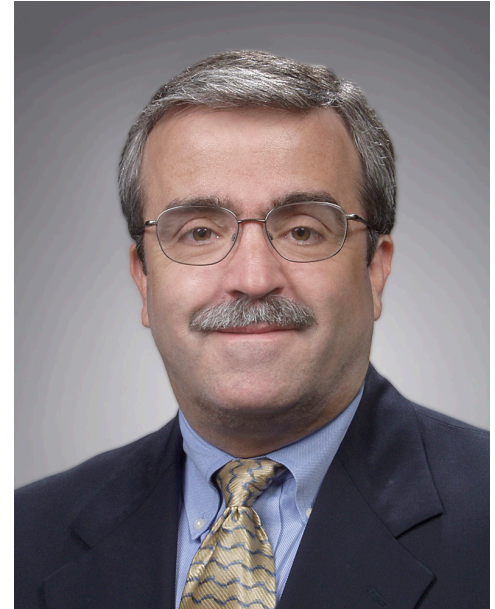
Cuyahoga County Treasurer