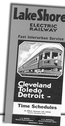
Lake Shore Electric Railway (1931) and Cleveland & Southwestern Railway (1925) time schedules.