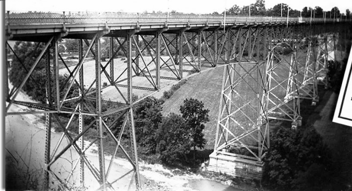
Cleveland & Southwestern Railway built the first high Lorain Road bridge over the Rocky River valley in 1895.